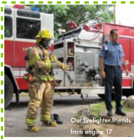
Our firefighter friends from engine 17

Gates of Life graduation ceremonies will take place on Wednesday, June 2nd at 9:00 a.m. in the gym. All are welcome! Families and friends are welcome to stay after the ceremonies for photos on the lawn and on the trike rack.